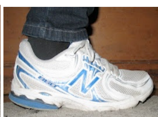
2 Roll foot