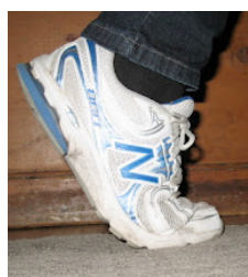
3 Push off with toe