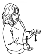
Choice and consent Whakaritenga mōu ake