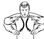
Your complaints taken seriously Amuamu